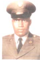
January 5, 1948 – June 23, 1968 Newnan Community Memorial Day May 29, 2006

and is buried in East View Cemetery in Newnan, Georgia.